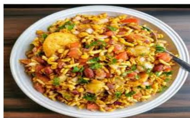
• Bhel puri