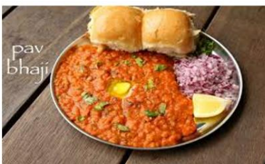
• Pav bhaji