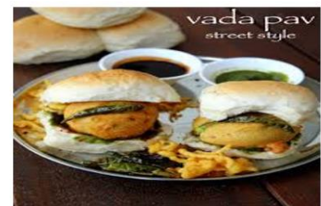
• Vada pav,