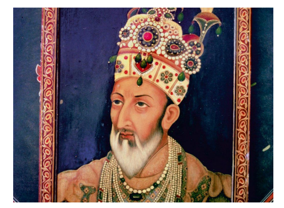
BAHADUR SHAH ZAFAR