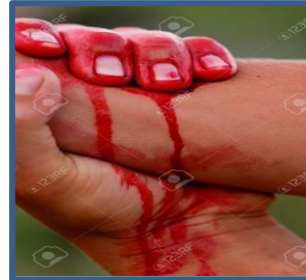
Stopping the blood flow