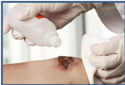
Cleaning the wound