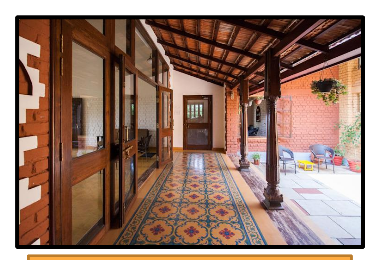
Veranda with courtyard