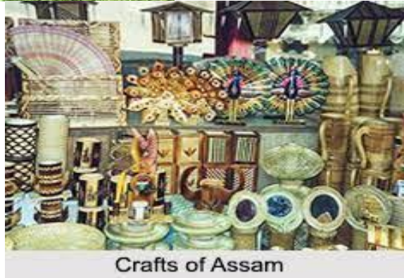
Crafts of Assam