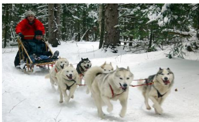
Huskies pulling a sledge