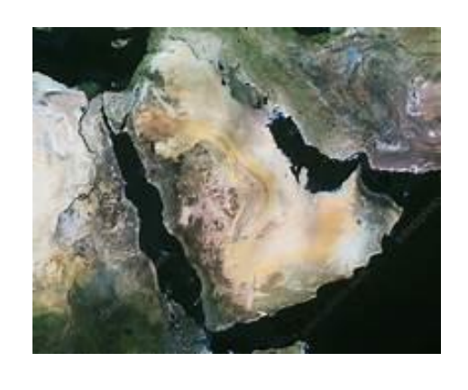
A peninsula is a piece of land jutting out into the sea.