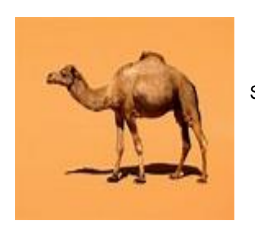
Ship of the desert- camel