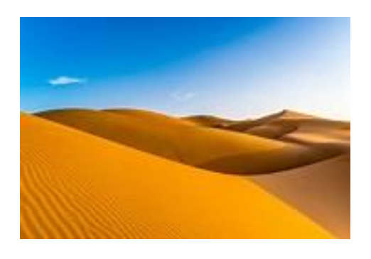
Small hills of sands are called sand dunes.