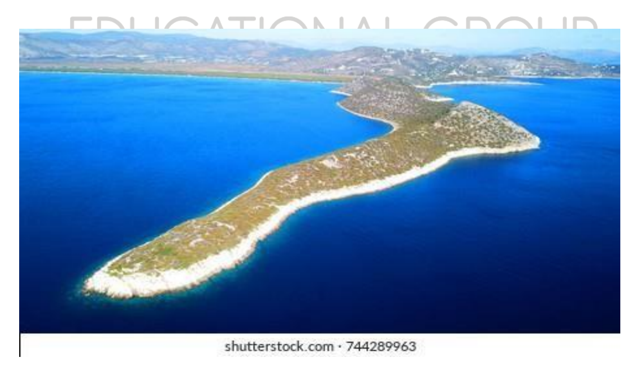
ODM Educational Group