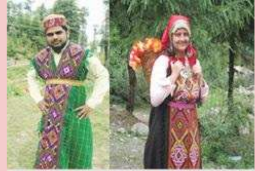
Costumes of Himachal Pradesh

1. The men wear tight pyjamas and loose shirts with colourful caps.