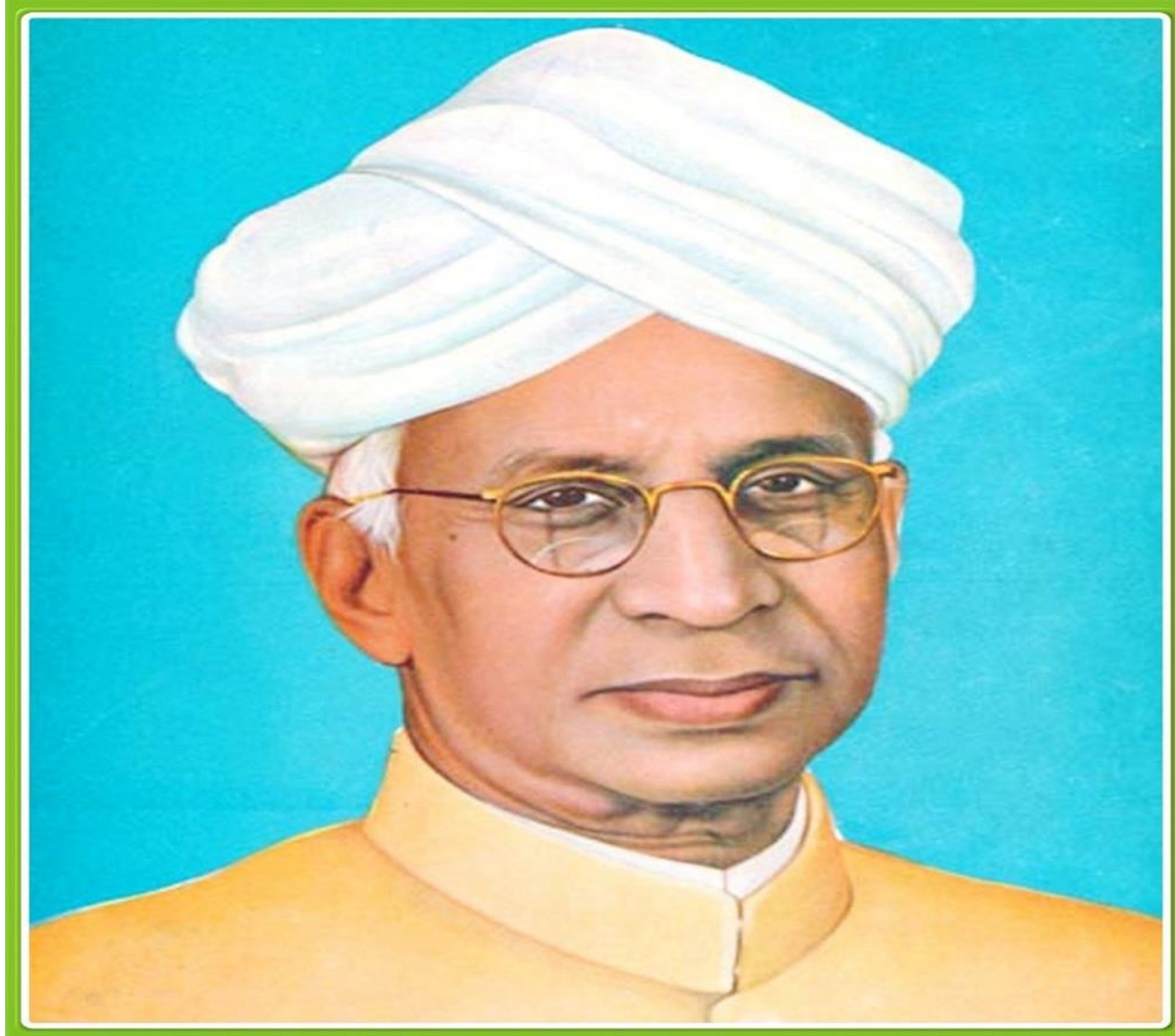
Dr S Radhakrishnan,