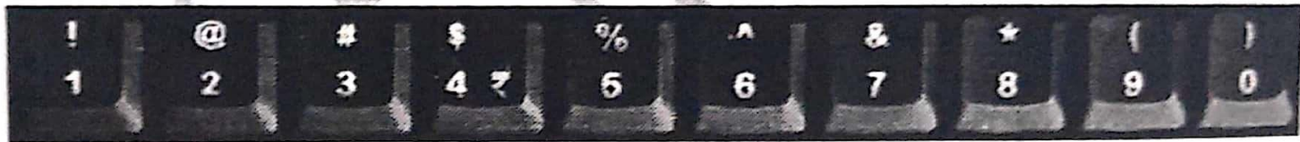
Fig. 2.11 Numeric Keypad on keyboard