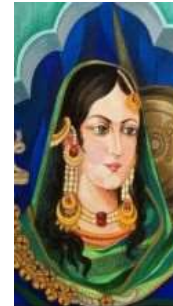
BEGUM HAZRAT (led revolt in Awadh-Lucknow)