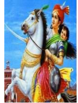
RANI LAKSHMI BAI (led revolt in Jhansi)