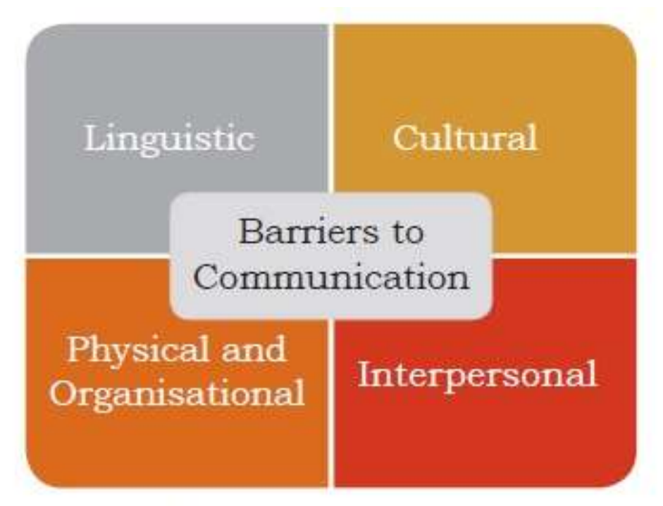
Figure 1.7: Barriers to Effective Communication