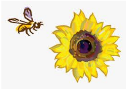
sunflower and bee