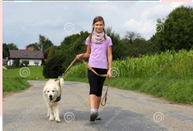
girl and dog

2. Complete the following sentences about your routine using before or after.