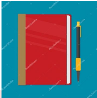
pen and book