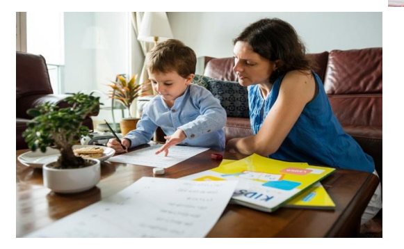
Mother takes care of children and their studies