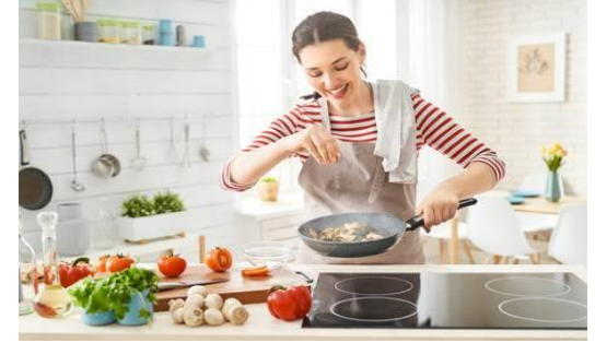
Mother cooks food for everyone.