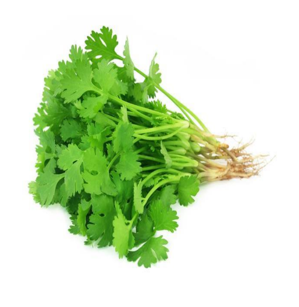
COCONUT ROSE CORIANDER