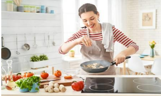
Mother cooks food for everyone.