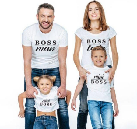
UNCLE, AUNT & THEIR CHILDREN