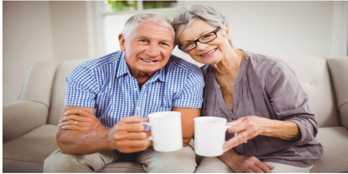
GRAND FATHER & GRAND MOTHER