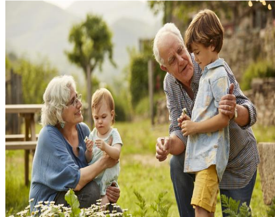
Grandparents play with the children