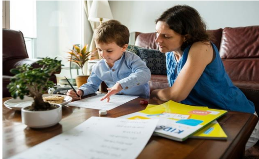
Mother takes care of children and their studies