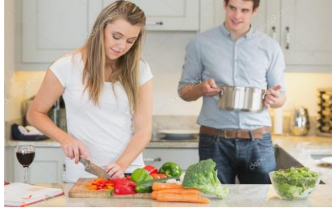
Father helps mother at home