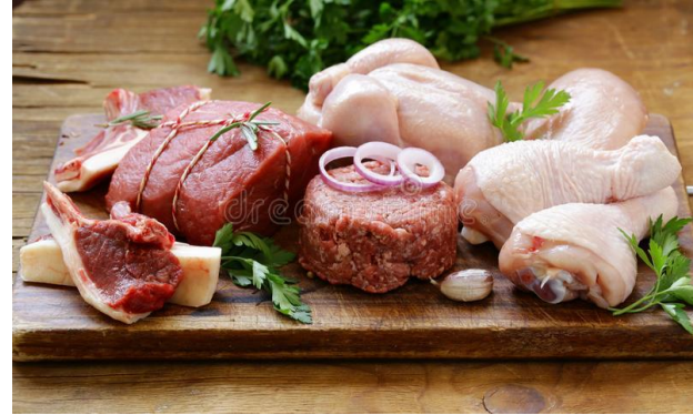
MEAT OF ANIMALS