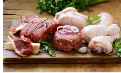
MEAT OF ANIMALS