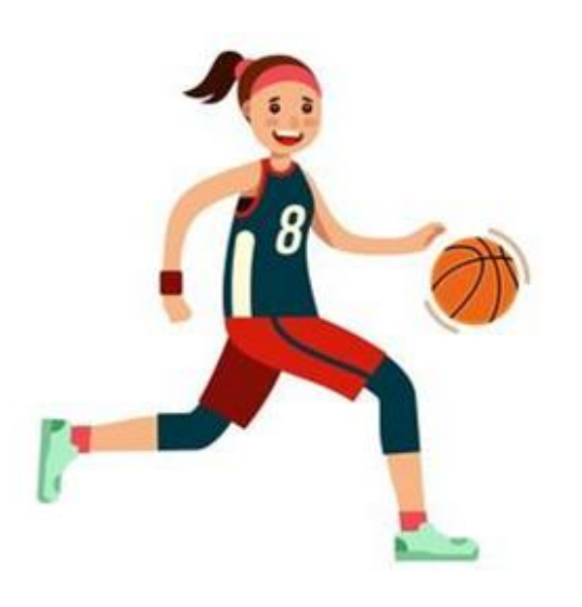
She plays basketball.