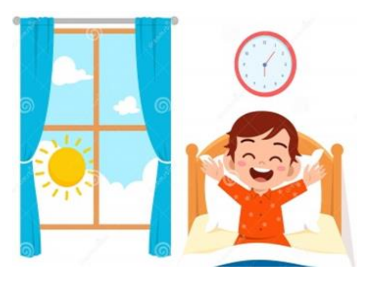
He gets up early in the morning.