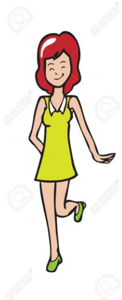
TH I N GIRL