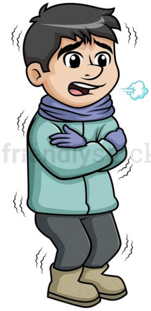
C OLD DAY