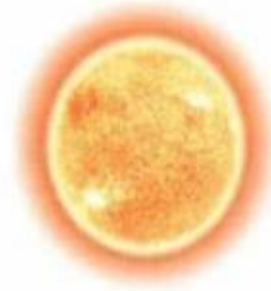
(d) hot sun