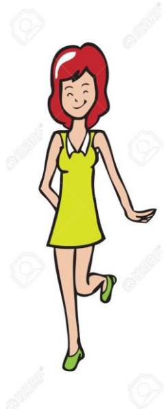
TH I N GIRL