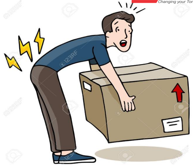
HEA V Y BOX