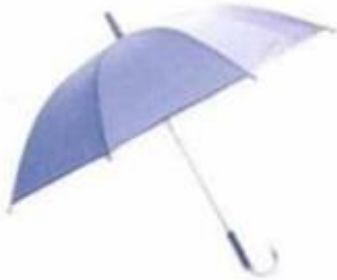
(e) blue umbrella