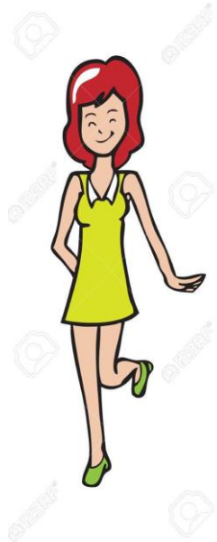
TH I N GIRL