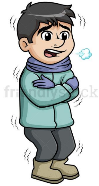
C OLD DAY