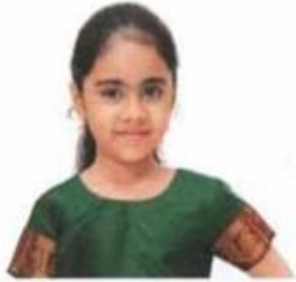
(c) little girl