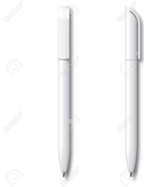
T WO PENS