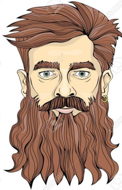
B AD FACE