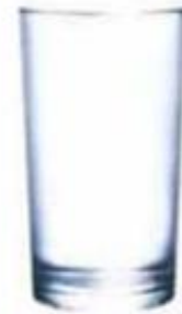
(f) empty glass