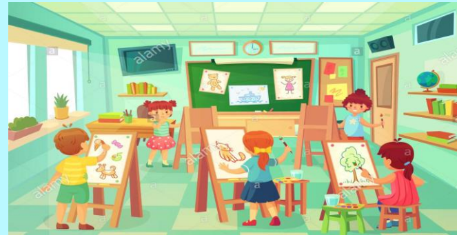
Riya paints pictures.