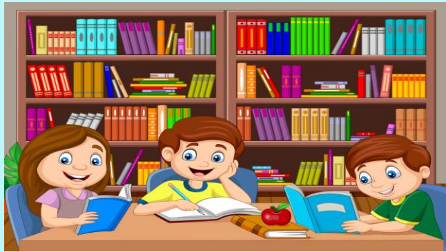
Riya reads story books.