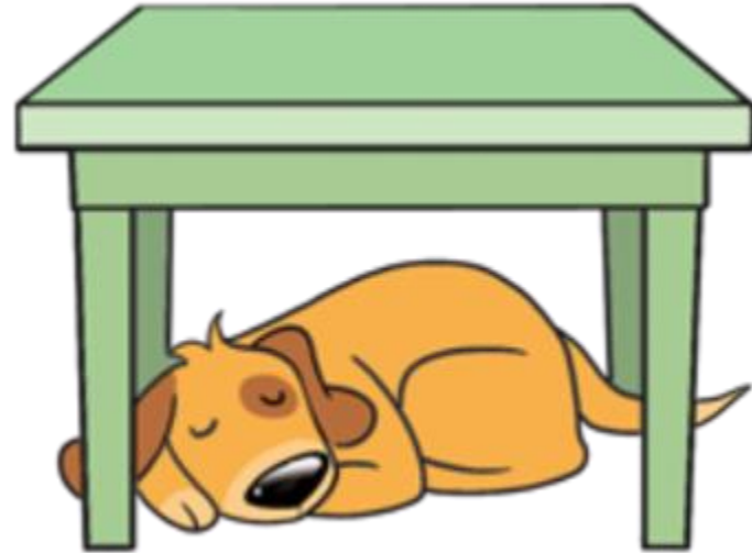
The dog is sleeping under the table.