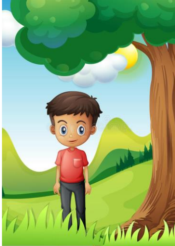
The boy is standing under the tree.