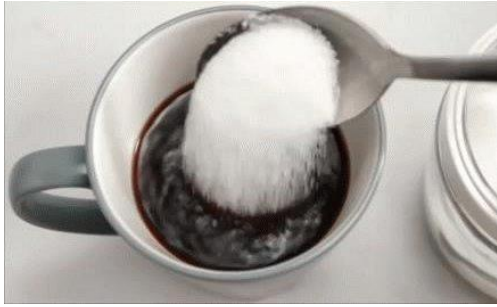
A spoon of sugar