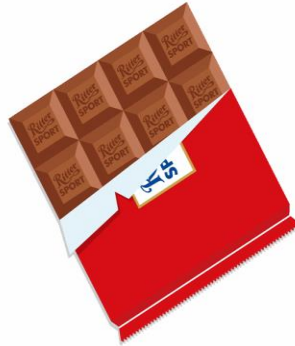
A bar of chocolate