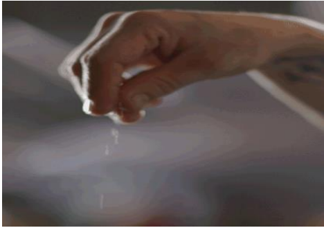
A pinch of salt