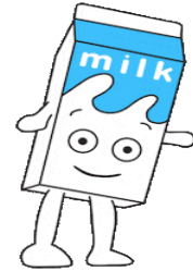
A carton of milk