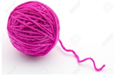
A ball of wool