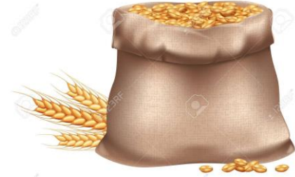
A sack of wheat