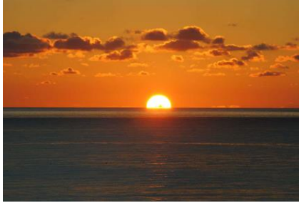
The sun rises in the east.