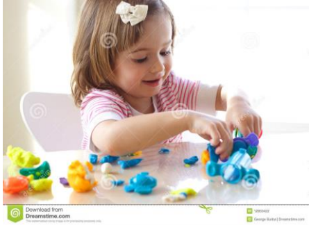
The girl plays with toys.

Look at these pictures and say what is happening: