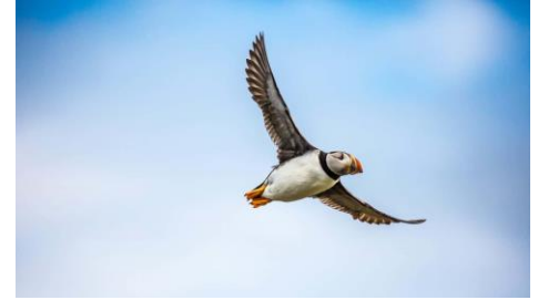
The bird flies .