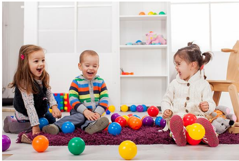
The children laugh .