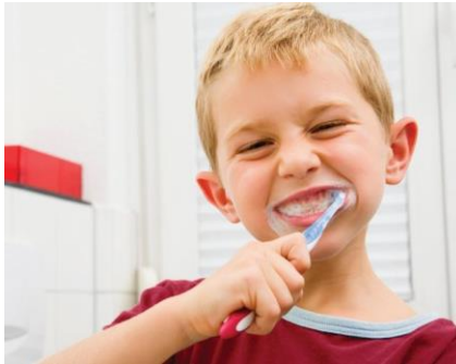
I brush my teeth everyday.