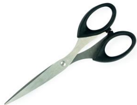
A pair of scissors

Some singular nouns occur in plural forms.