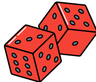
A pair of dice