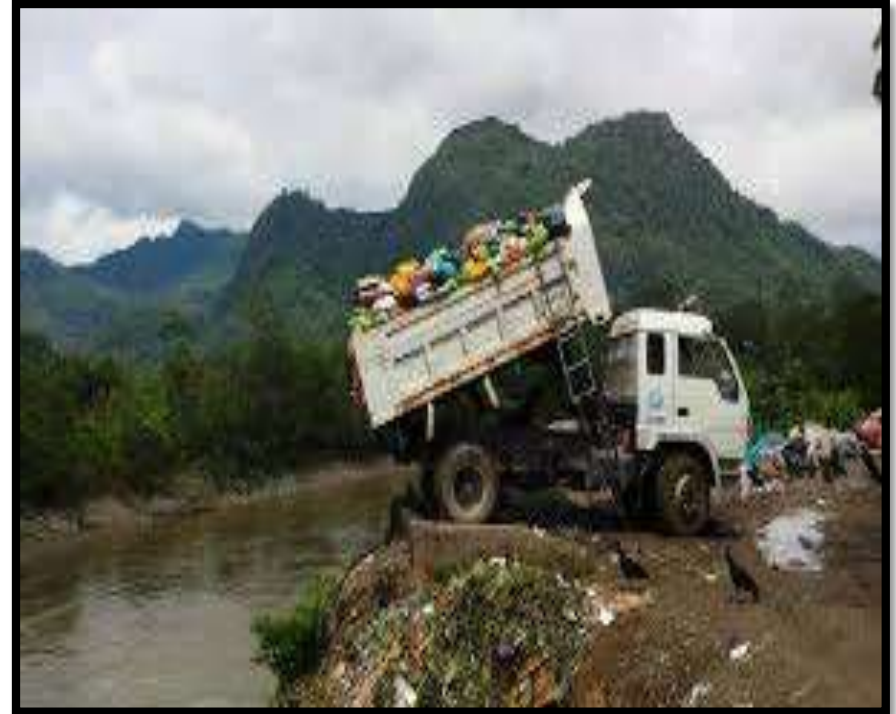
Garbage dumped in a river