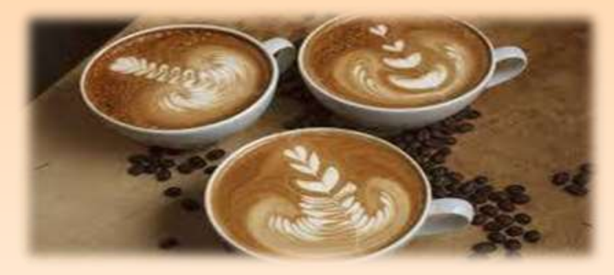
We ordered for three <u>cups</u> of coffee.