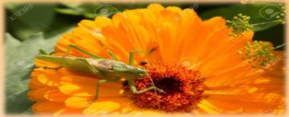
A green grasshopper is sitting on the flower.