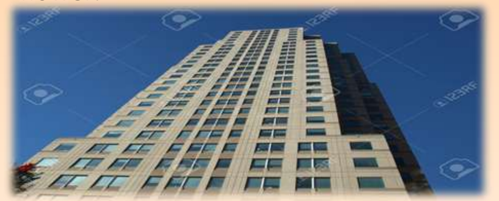
I live in a tall building.