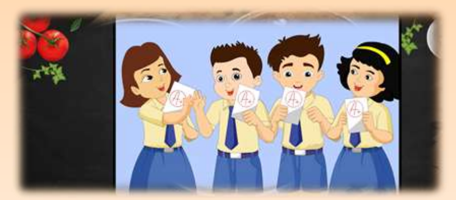
All the students have passed the test.