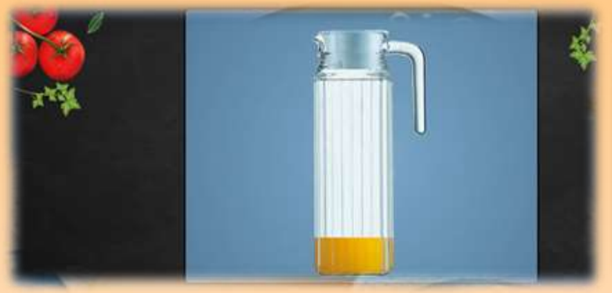
There is a little juice in the jar.