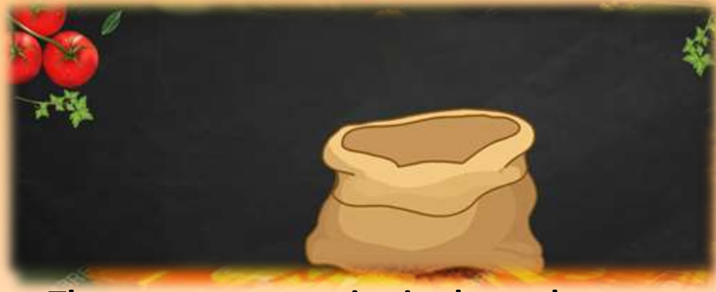
There are many grains in the sack.