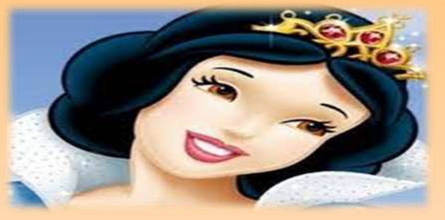
The beautiful princess is smiling.