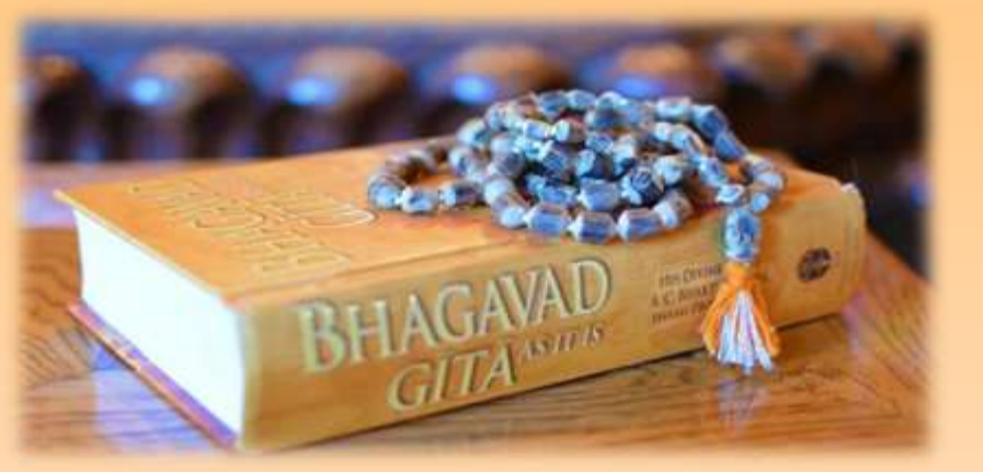
The Bhagavad Gita is a holy book.