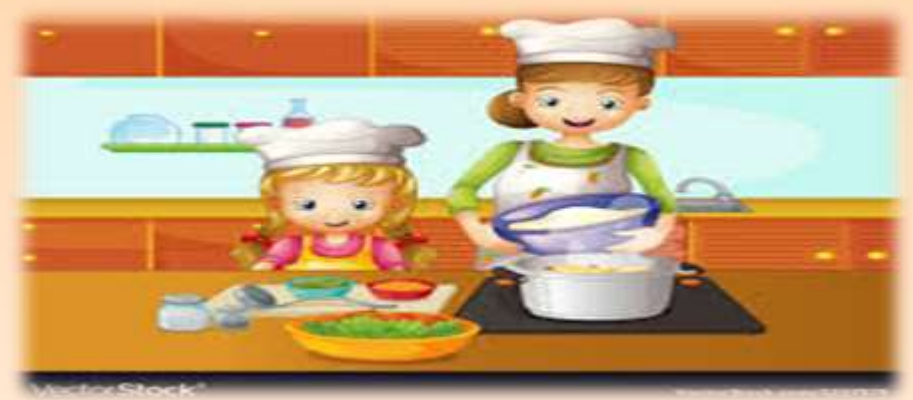
My mother cooks delicious food.