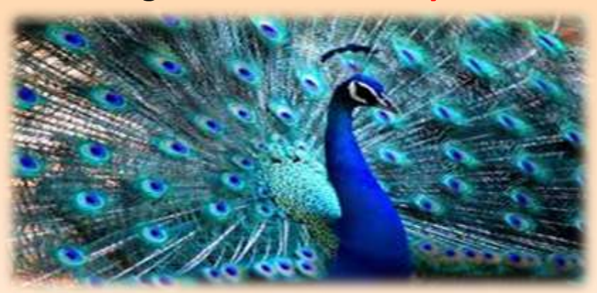
The peacock is a colourful bird.