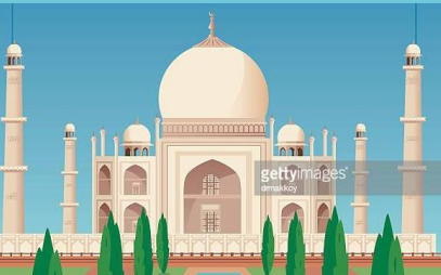
The Taj Mahal