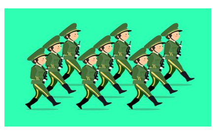
an army of soldiers