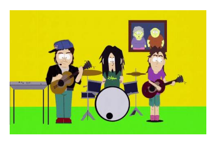
a band of musicians