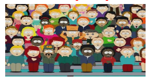
a crowd of people