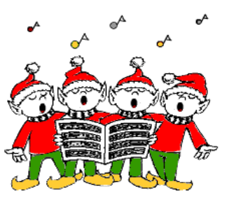
a circle of