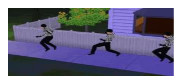
a gang of thieves