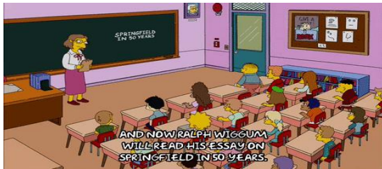
a class of students