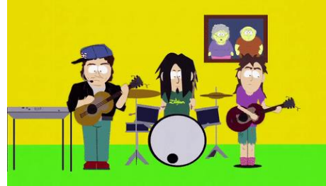
a band of musicians