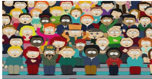
a crowd of people