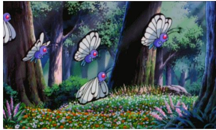
a swarm of butterflies