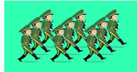
an army of soldiers