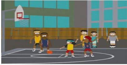
a team of players