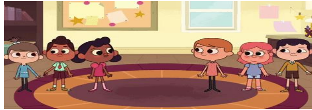
a circle of friends