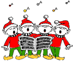
a choir of singers