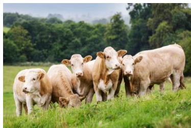
a herd of cattle