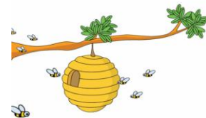
a swarm of bees