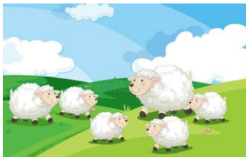
a flock of sheep