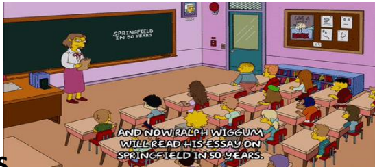
a class of students