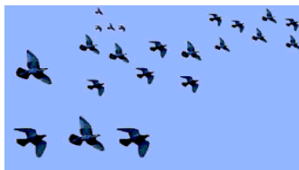
a flock of birds