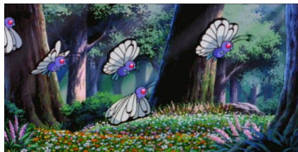
a swarm of butterflies