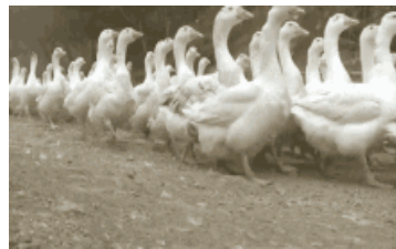
a gaggle of geese