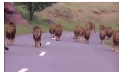
a pride of lions