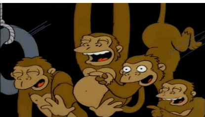
a troop of monkeys