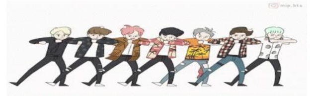
a troupe of dancers