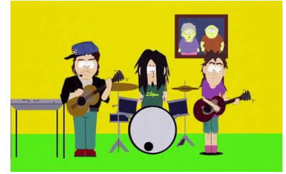
a band of musicians