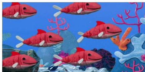
a school of fish