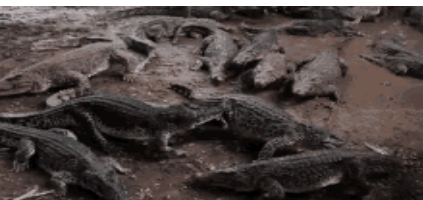
a bask of crocodiles