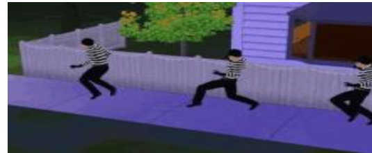
a gang of thieves