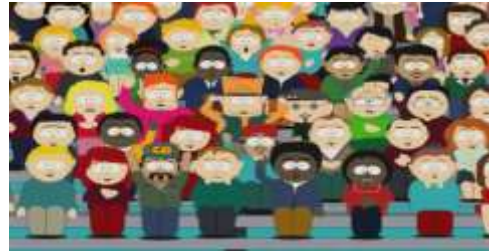
a crowd of people