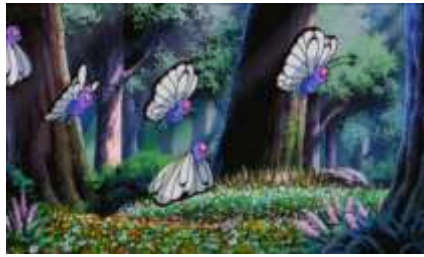
a swarm of butterflies