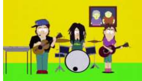
a band of musicians