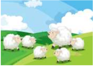
a flock of sheep