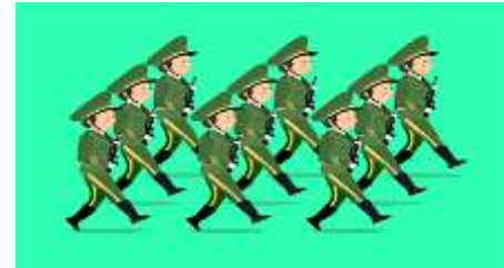
an army of soldiers