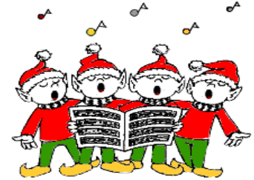
a choir of singers