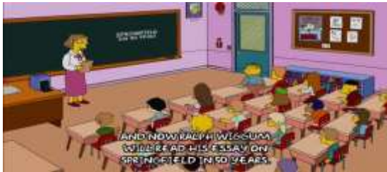
a class of students