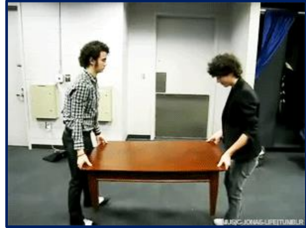
Table is moving not by itself

We can say that only living things move on their own. However, the non living things can not move on their own.