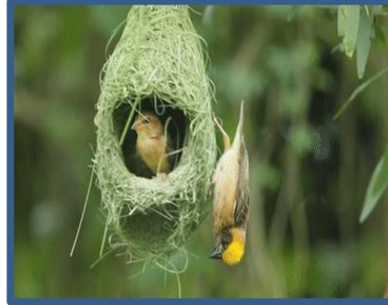
The weaver bird

The weaver bird makes a beautiful and strong nest with twigs and grass. It weaves the grass in and out rapidly. The nest hangs from the branch of a tree. The bird enters its home through a tunnel like opening at the bottom of the nest.