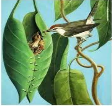
The tailor bird

The tailor bird uses its beak like a needle to sew leaves with material like thread and wool. The nest is made cozy with cotton, wool, hair or dry grass.