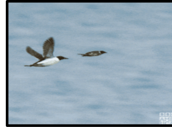
BIRD FLYING FOR FOOD