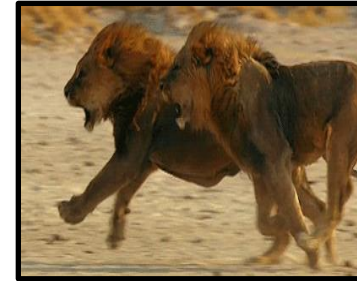
LION RUNNING FOR FOOD