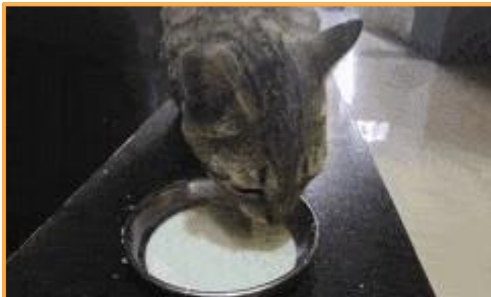
CAT IS LAPPING MILK