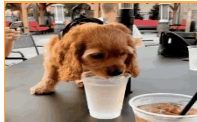
DOG LAPPING WATER