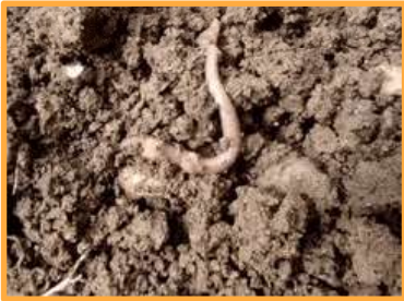
Earthworm in the soil