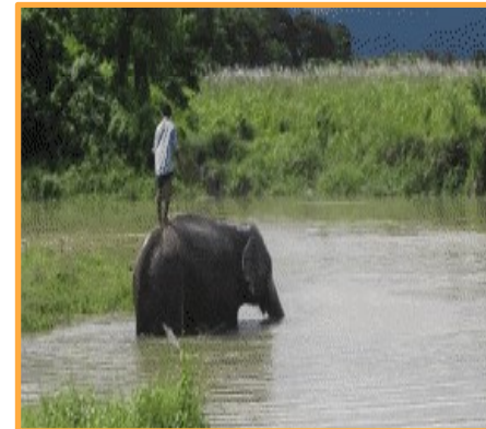
Shooting water like a fountain