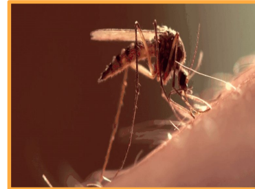
Mosquito sucking blood