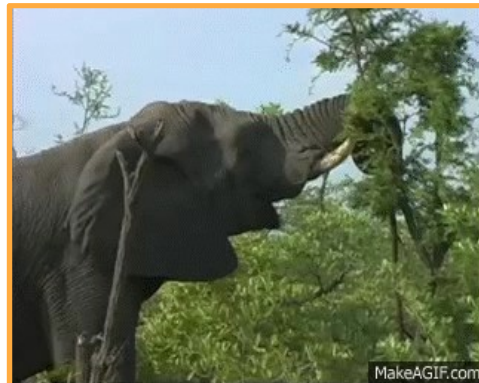
Tearing off branch