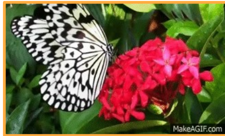
Butterfly sucking nectar