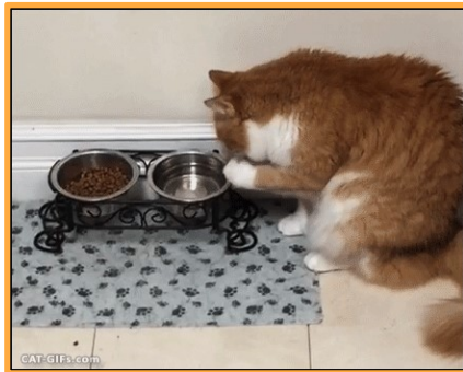
Feeding in clean vessel