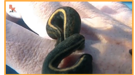
Leech sucking blood