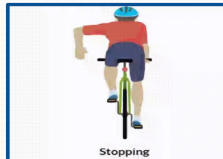
Bicycle riding with signs