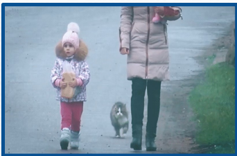
Walking on safe side