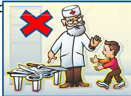
No to sharp objects