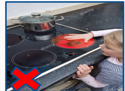
No to hot pans