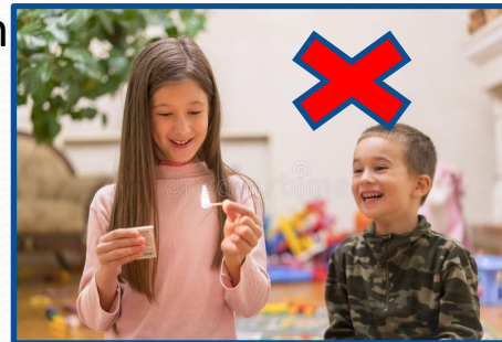
No to matchsticks