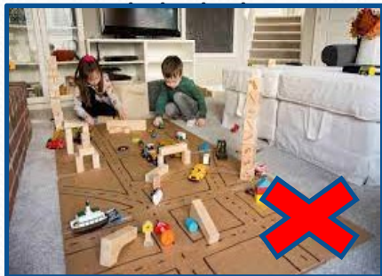
No things on the floor