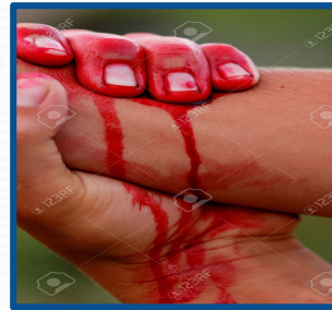
Stopping the blood flow