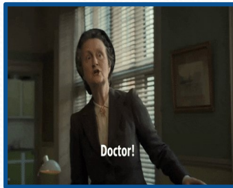
Calling a doctor