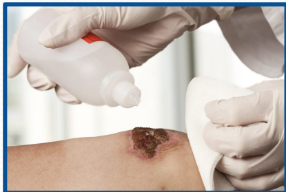
Cleaning the wound