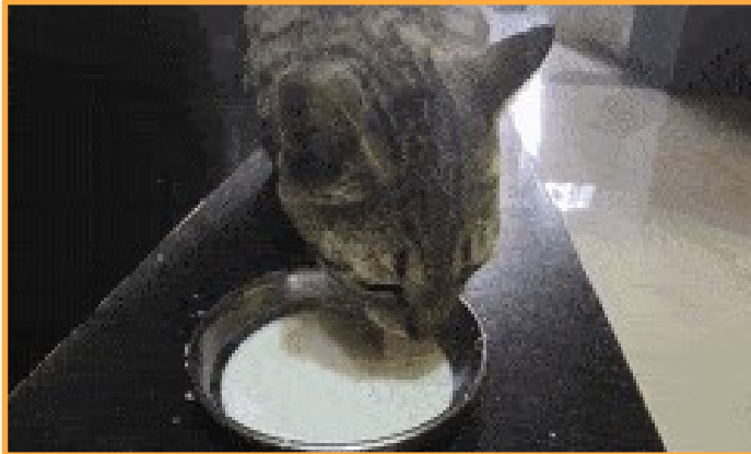
CAT LAPPING MILK