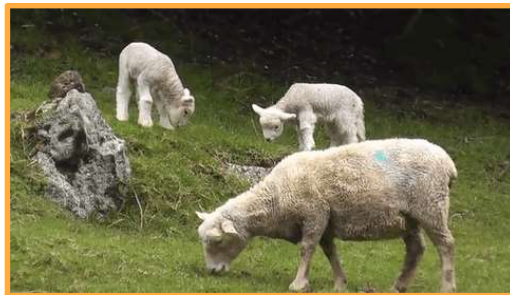
SHEEP SWALLOWING THE GRASS