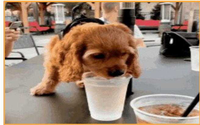
DOG LAPPING WATER