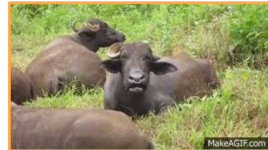
BUFFALOE CHWING THE CUD