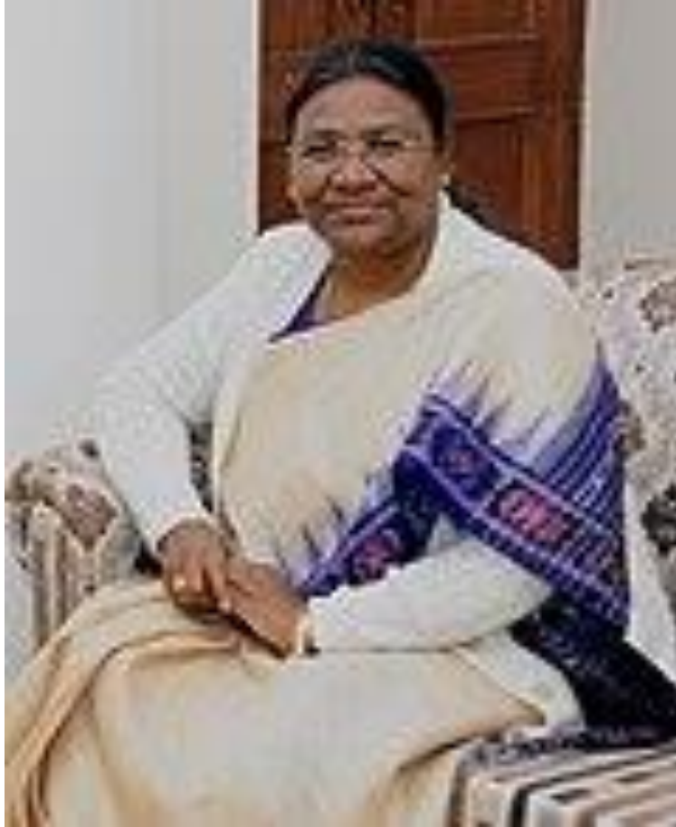
Mrs. Draupadi Murmu is the current president of India. of India. of India