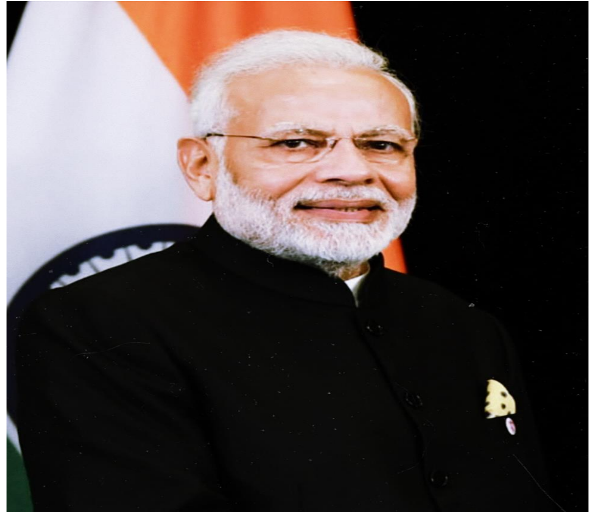
Mr. Narendra Damodardas Modi is the current prime Minister