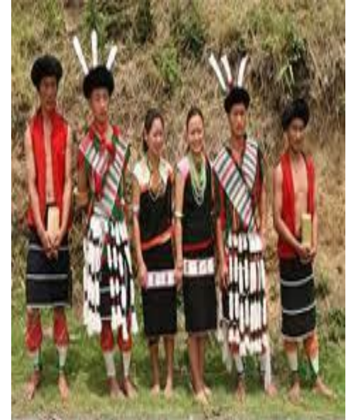
Traditional Dresses of Nagaland