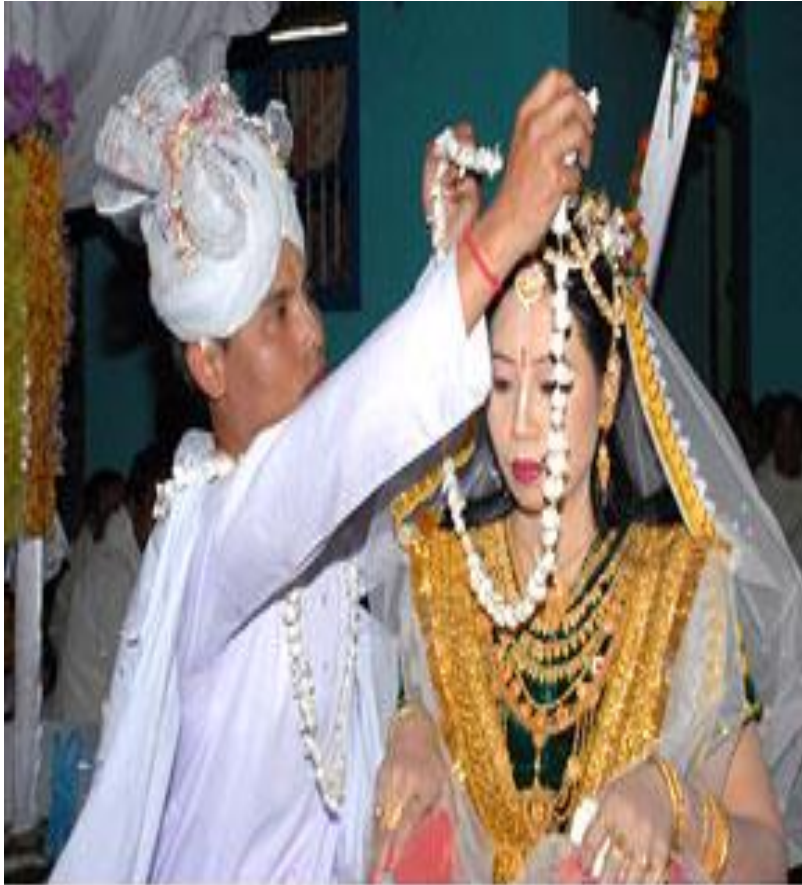
Manipuri Wedding Ceremony