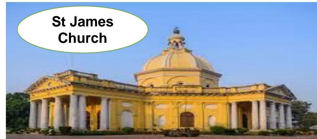
St James Church