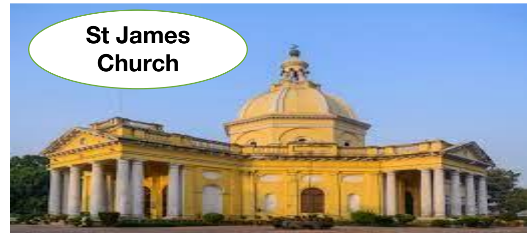
St James Church