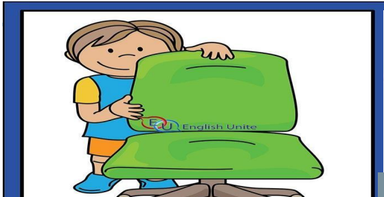
The boy is standing behind the chair.