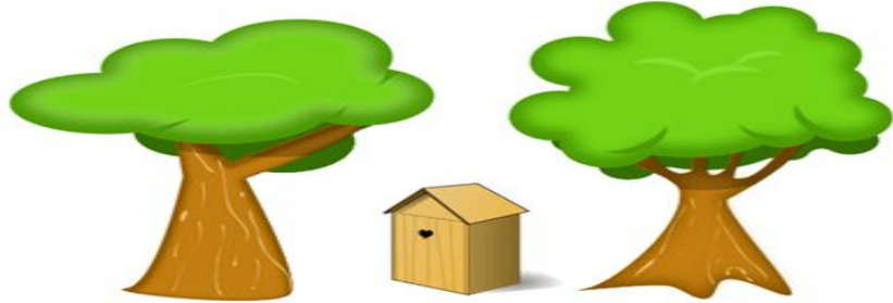
There is an outhouse between the two trees.

Between is used when someone or something is in the middle of two other things or people. Example –