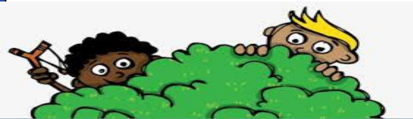
The children are hiding behind the bush.